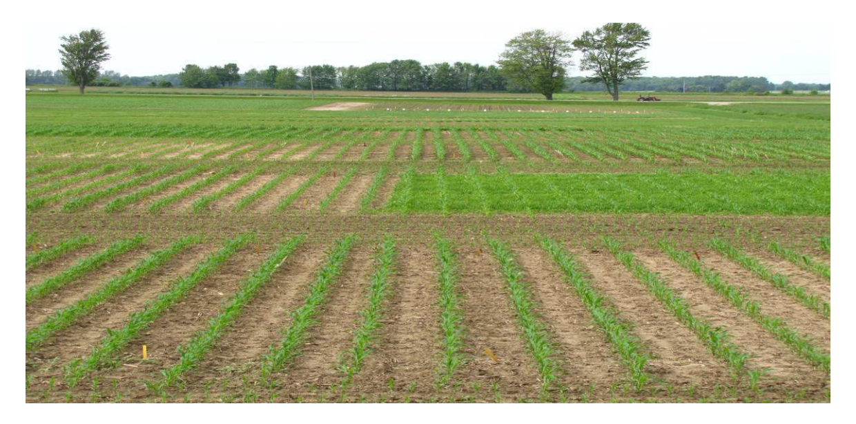
Figure 1. Photo of population and stress experiment at Elora with plots of increasing weed stress and soil compaction.