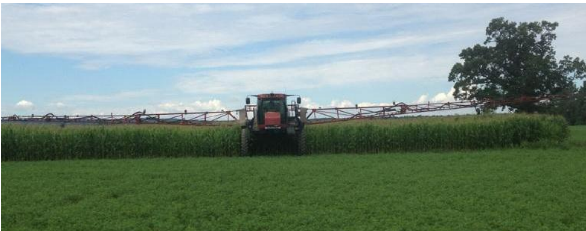
Image 1. Fungicide Application at VT Stage of Corn.

Proline ® fungicide was applied at the tasseling stage (VT) of corn on different farms in eastern Ontario in each of 2013, 2014 & 2015. At harvest, silage weights and moisture were measured. A fresh sample of silage was collected from which mycotoxin analysis was completed from each plot. All sites had a minimum of 2 replications of an untreated control and a Proline ® fungicide treatment.